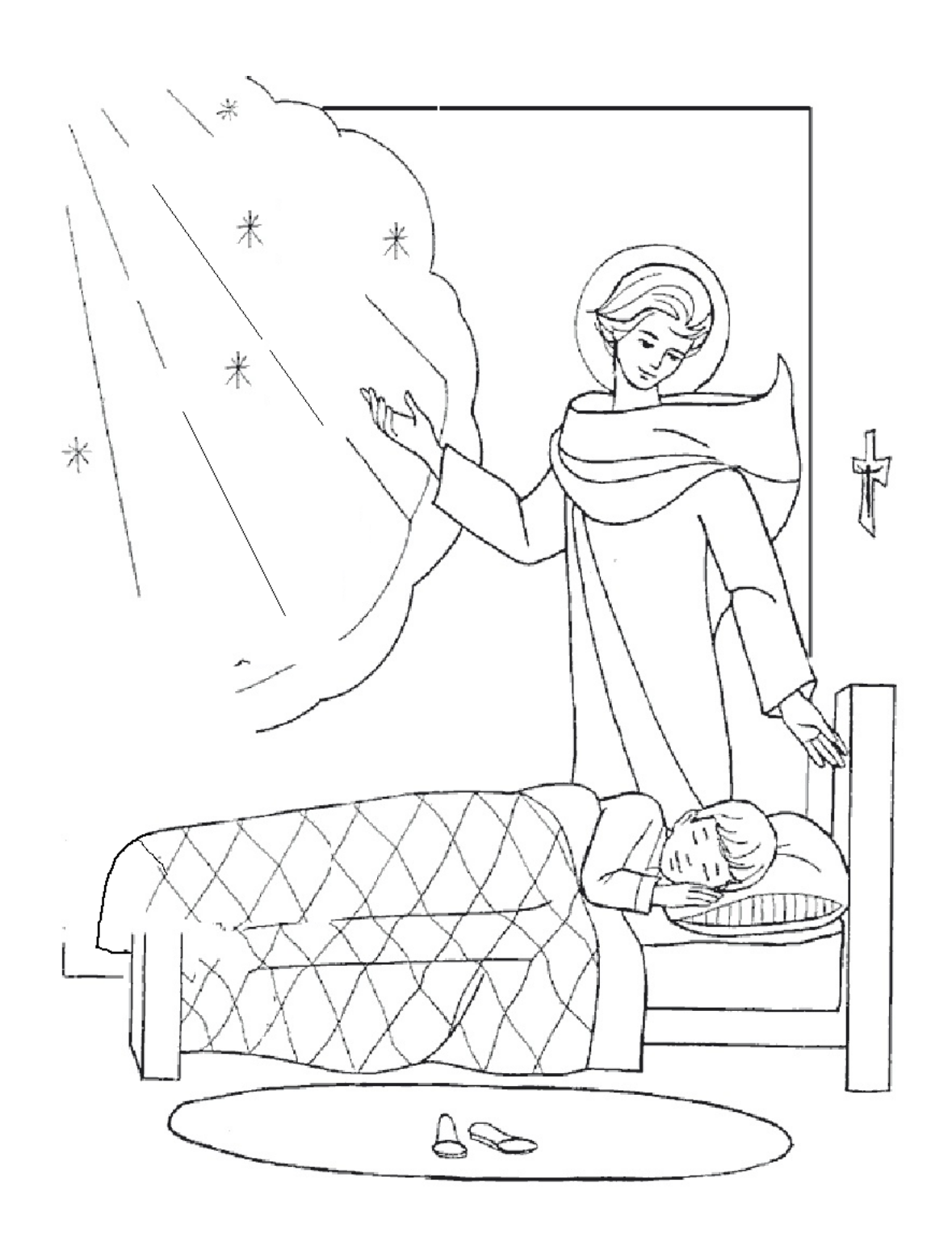
His angels are watching over you! Psalm 91