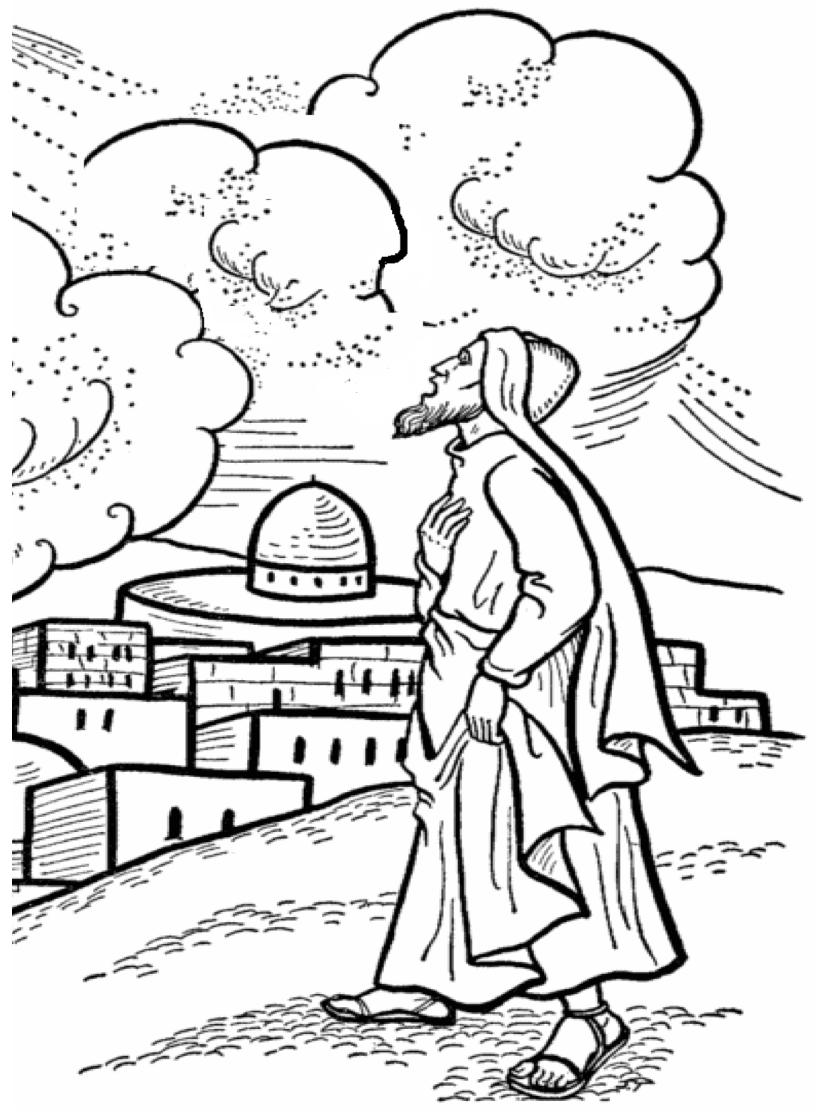
A poor, wise man saved his city, with his wise words. Ecclesiastes 9:14-18